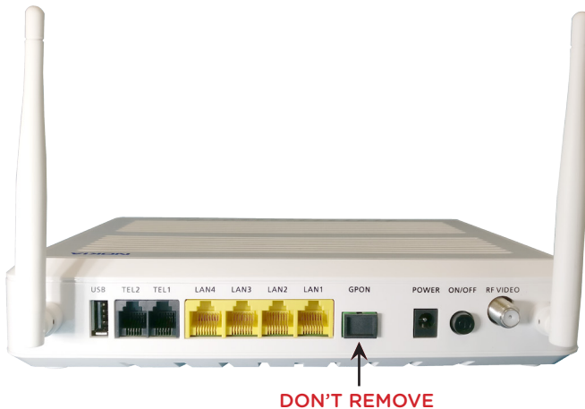
An example fibre optic modem back panel (Nokia G-241W-A).